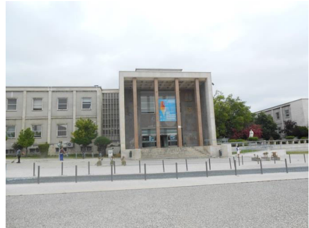
The conference venue – Faculty of Letras, University of Lisboa, Lisboa, Portugal.