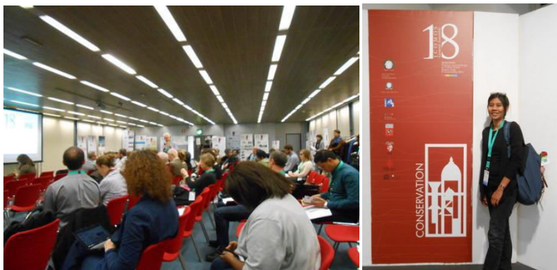
Picture2. Theme 5 during the discussion session and me as participant